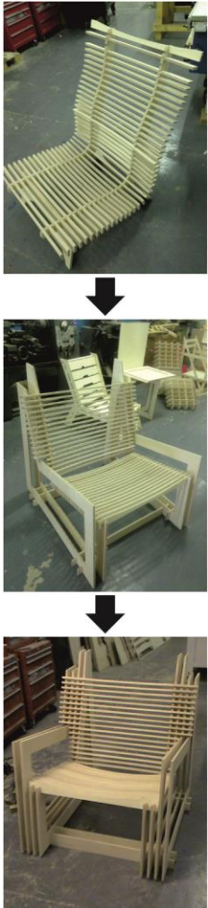
Figure 3: Three iteration of prototypes