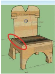
Figure 4: Engaging with the materiality of design

Stage1: Designer has difficulty with understanding design for assembly